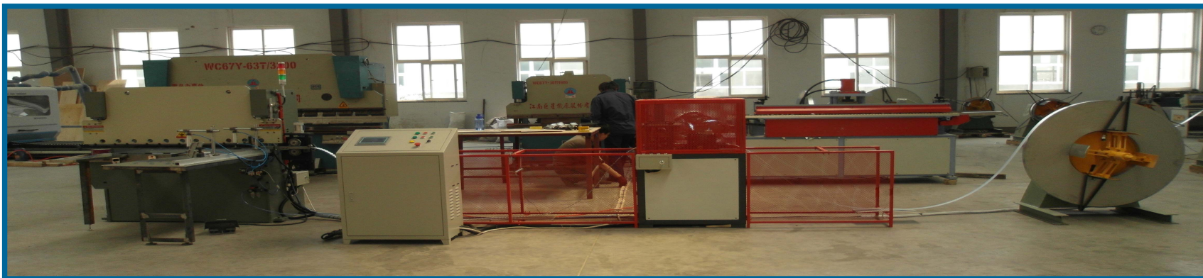
Testing & Adjusting Workshop