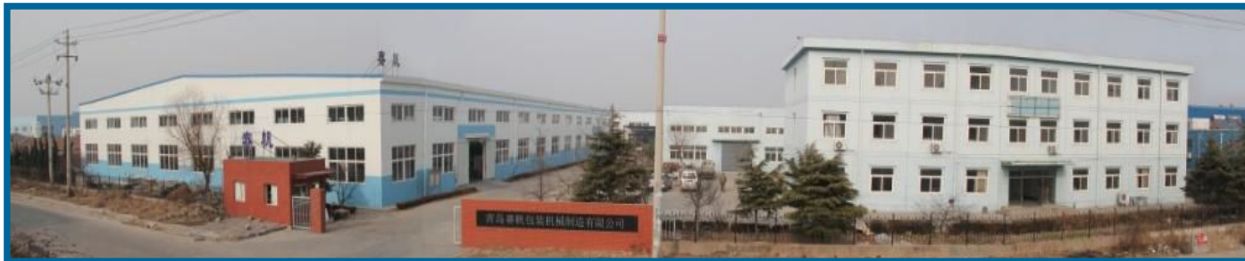
No.2 Factory, 7,000 square meters ,including 4,800 square meters' workshop and 400 square meters' office building

In 2003 , Qingdao SenHao Industry & Trade Co.,Ltd was Founded