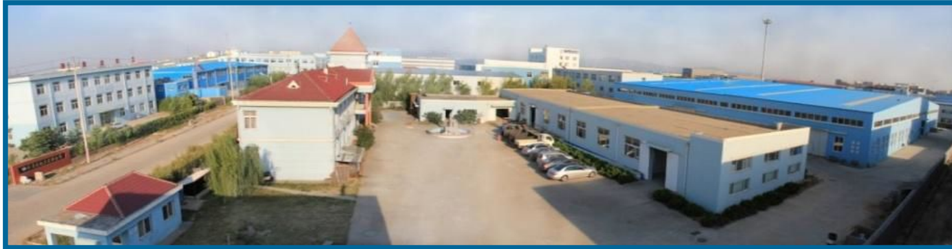
No.1 Factory, 13,000 square meters ,including 6,000 square meters workshop and 300 square meters office building