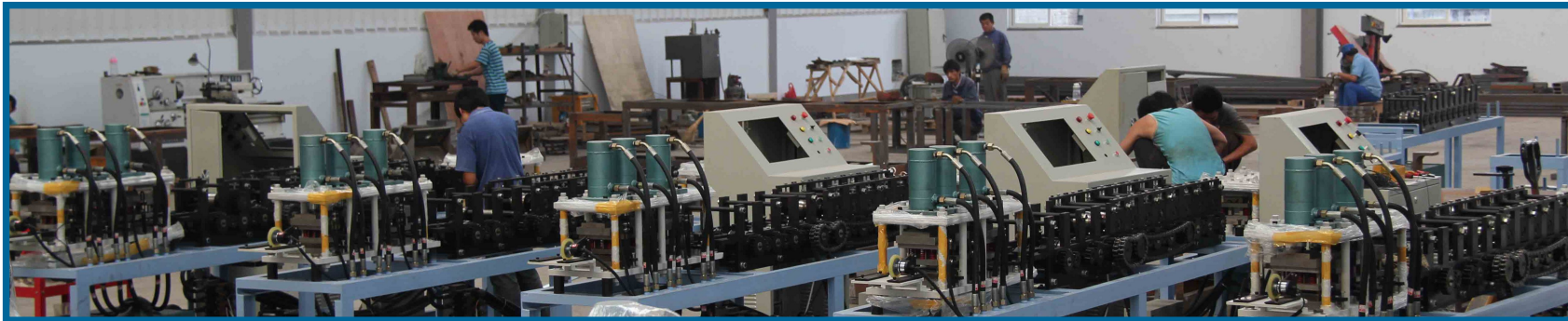
Workshop of Nailless plywood box machine